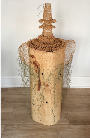
Tethered Rhythm , Amate bark paper, encaustics, metallic leaf, jute twine, cheesecloth, paint, thread, waxed linen, wood beads and stone, 2024, $500