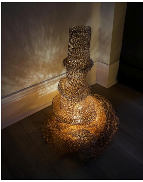
Bioluminescence 5 , Maple veneer, encaustic, paper covered wire and light, 2024, $400