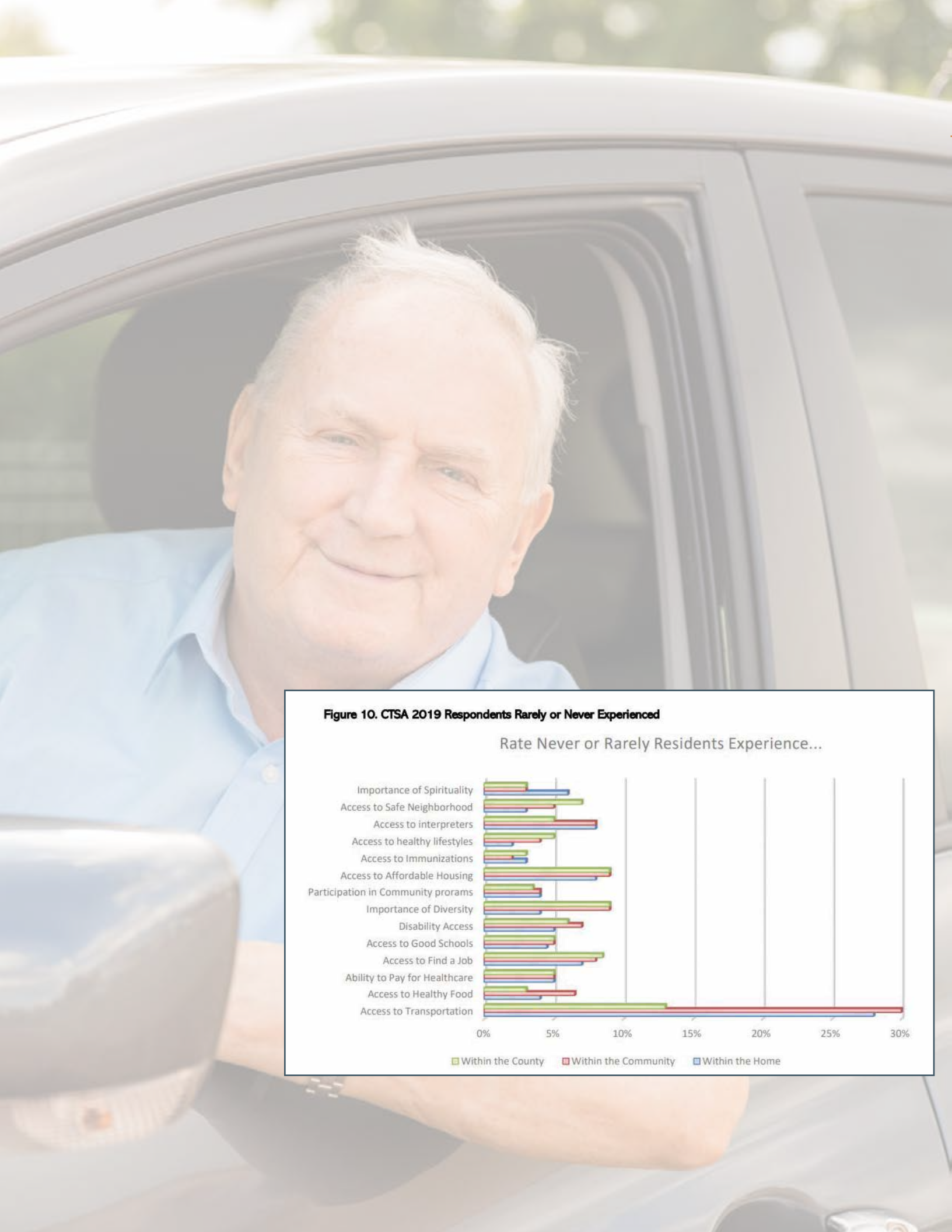
Figure 10. CTSA 2019 Respondents Rarely or Never Experienced