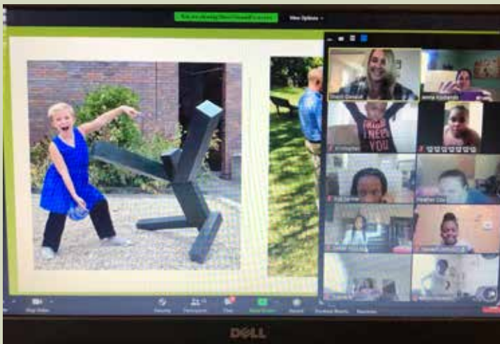
Sculpture above: Untitled by Joel Shapiro