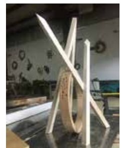
Stargazing With Contrails