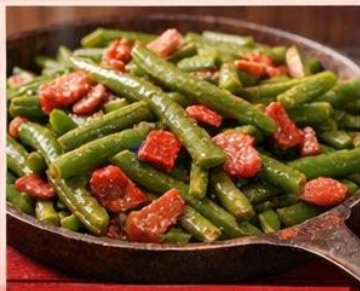
Green Beans & Bacon