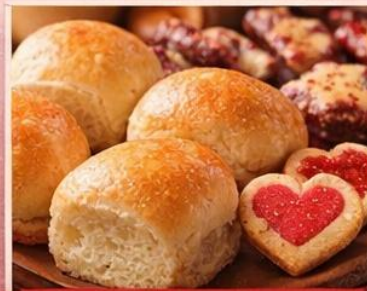
Dinner Rolls & Desserts