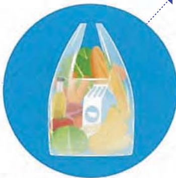
Plastic grocery bags