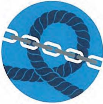
Ropes, chain, cordage