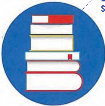
Hard cover books