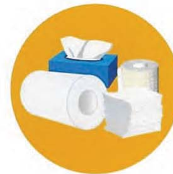
Tissues, Napkins, Paper Towels