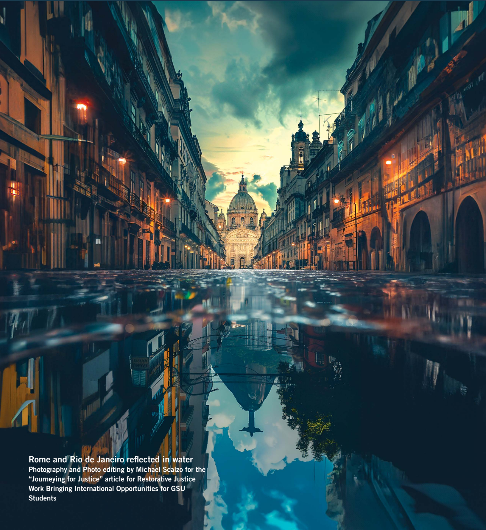
Rome and Rio de Janeiro reflected in water Photography and Photo editing by Michael Scalzo for the “Journeying for Justice” article for Restorative Justice Work Bringing International Opportunities for GSU Students