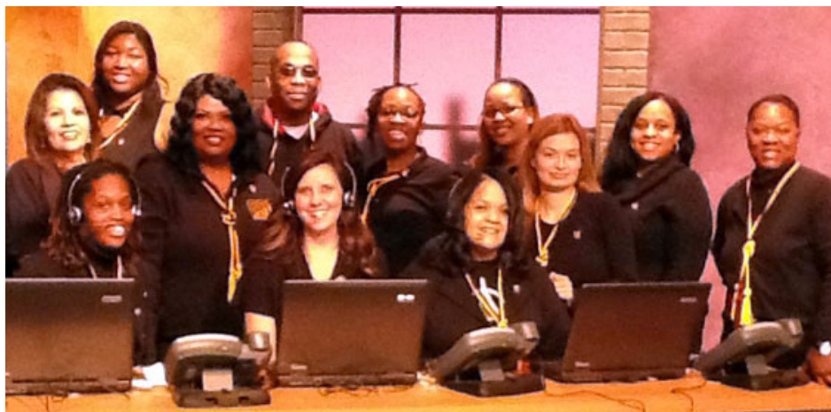
Tau Sigma National Honor Society, Delta Delta Chapter participated in a Service Day at the local public access TV station WTTW in Chicago.

Other events included: "How to Start a Conversation" that provided information and discussion about how to begin talking about violence to various age groups. "Pledge to be a Pal," was a commitment to support someone in a violent situation and "I Care T-Shirts" which was an outward expression of the desire and support to end violence.