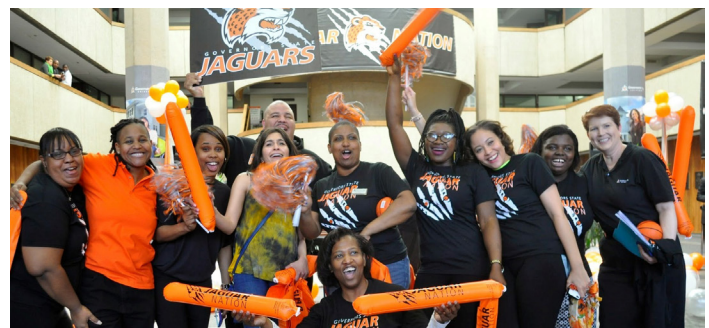
Students and staff celebrate Jaguar Nation!