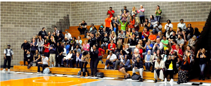
The crowd cheered for their favorite mascot nominee.