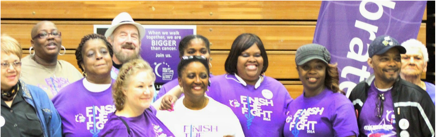
Cancer survivors pose for the camera after completing the survivor lap in the Relay.

Governors State University’s Relay for Life was held on April 5, in the Recreation and Fitness Center boasting 12 teams and 58 participants and raised $5,076 in its first year. This event was hosted with the purpose of bringing the community together to celebrate life and fight against cancer. The atmosphere was warm, inviting and supportive. The energy was electric in the gymnasium as survivors took their lap and were celebrated for their courage and victory against cancer. There was music, claps and cheers for these men, women, boys and girls that are continuing the fight! As part of the event, the survivor brunch brought about smiles, tears and support for the participants as they shared the stories of their journey through their difficult times. Below are comments from the event participants: