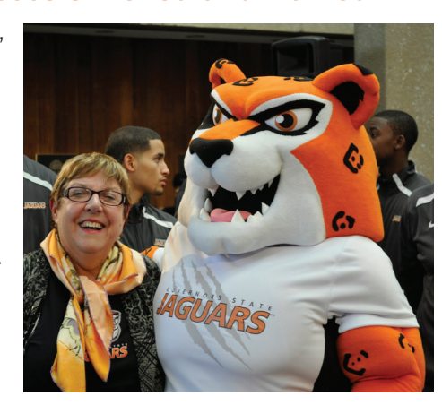
President Maimon with Jax!

The final phase of "Operation Mascot" kicked off on September 6, 2014. This movement encouraged students and the GSU campus community to submit their suggested name for the GSU mascot.