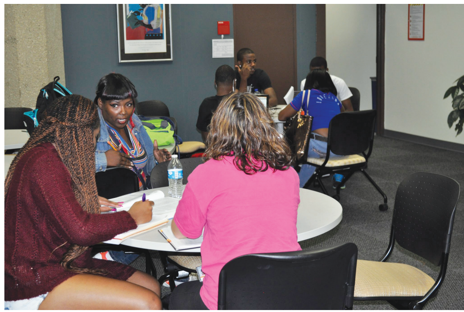
ARC/Writing Center Open House was held on September 18th with a packed house!

To celebrate the new look of the Academic Resource Center, an open house was held on Thursday, September 18. The event introduced faculty and students to the new resources and new facilities. If you haven't yet, visit the new space and use our resources, the Academic Resource Center is open Mondays through Thursdays, 9 a.m. – 7 p.m. and Fridays, 9 a.m. – 5 p.m. in B-1215, off the Hall of Governors.