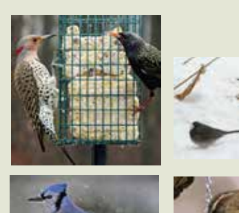
(Crete) Bordwell House Certified Wildlife Habitat photos of birds

Year-round we are visited by a variety of woodpeckers, including downy, hairy, red bellied and flickers. This year we are thrilled to have a red headed woodpecker – so beautiful! My favorites are probably the songbirds such as the nuthatch, chickadee, cardinal and titmouse because of their extreme friendliness, but both the house and Carolina wren, house, gold and purple finch, assorted hawks and various sparrows visit us as well. The Blue jay, junco and robin come and go depending on the season.