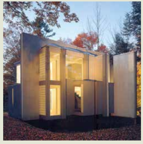
House VI / Peter Eisenman