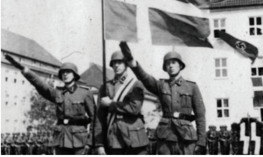
German troops carrying a Danish flag, giving the Nazi salute. The Danes pretended to welcome the Germans, though in reality, they hated their occupiers.

however, and the <u>Danish Resistance</u> movement was formed.