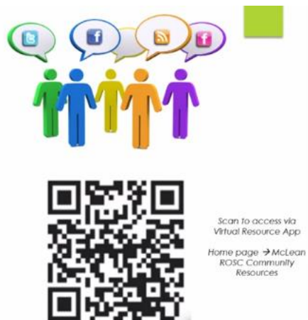
(Left: Outreach Plan)